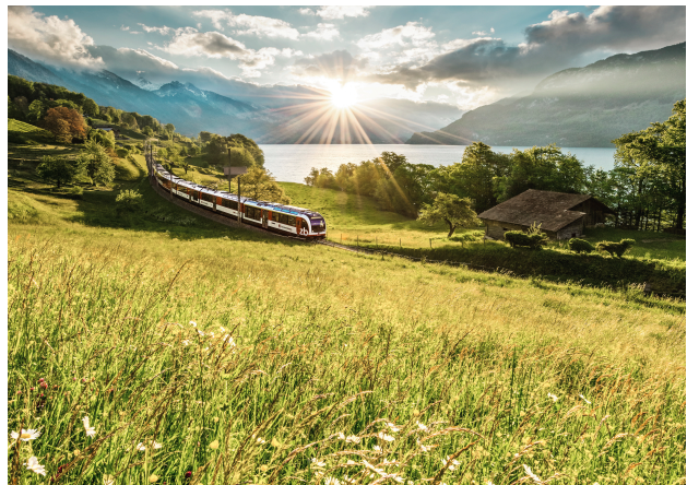
Luzern-Interlaken Express at Lake Brienz, Bernese Oberland